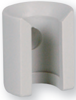
Part # 201260