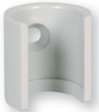
Part # 203510