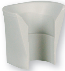
Part # 203480