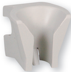
Part # 224190