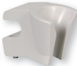
Part # 224390