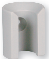
Part # 201310