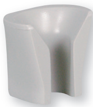
Part # 201220