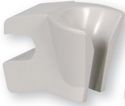
Part # 204320