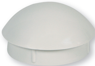
Part # 203110

Part # 200910 FTG 1/2, MPT X 3/8 CC • Solid Brass • CC = Copper Compression