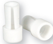
Part # 205056

Part # 205055 SLEEVE CLAMP, 1/8, 2 PC, CLEAR Part # 205056 SLEEVE CLAMP, 1/8, 2 PC, WHITE • Polypropylene Construction